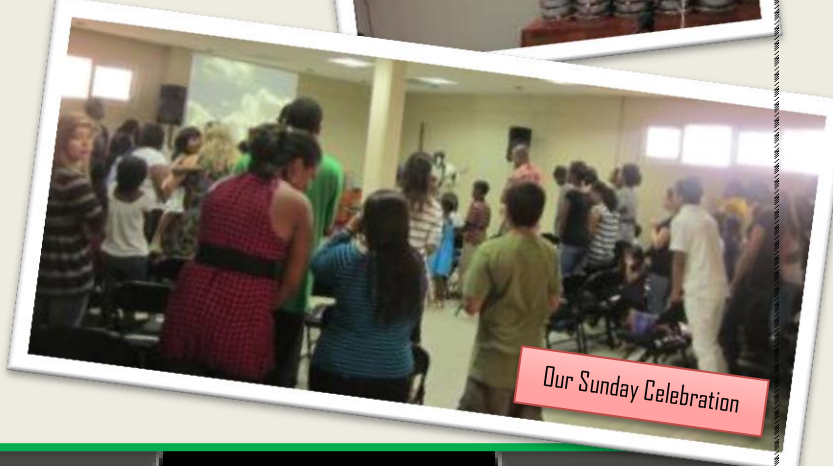
Our Sunday Celebration