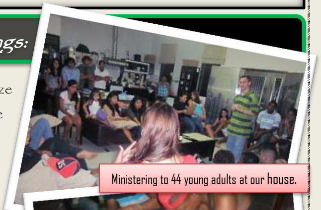
Ministering to 44 young adults at our house.