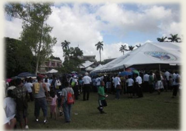
Pics of George Price funeral - a nationally huge event. 1000's attended.