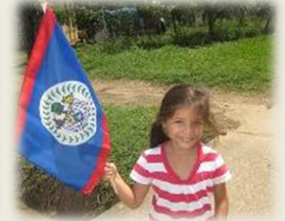
Pics of baptism and some of the independence parade